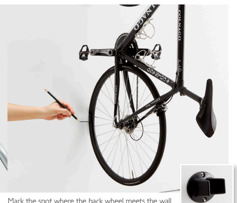
Mark the spot where the back wheel meets the wall